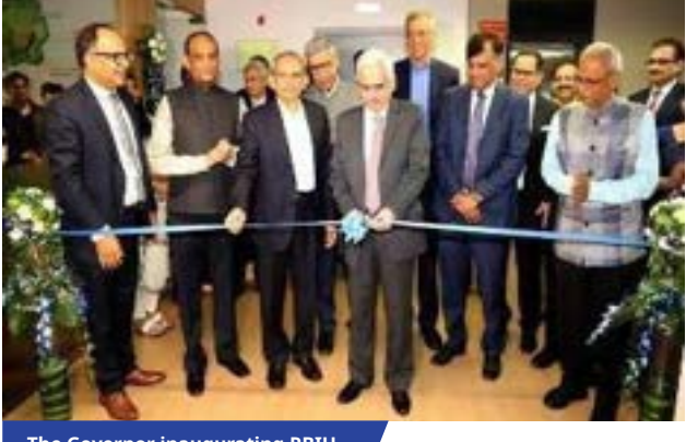
The Governor inaugurating RBIH