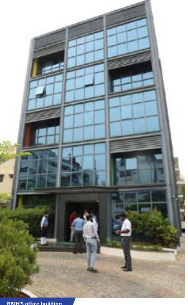
RBIH'S office building

The Company's principal business is creating an ecosystem conducive to technological innovation in financial services; develop capabilities for innovation; focal point for networking of experts; act as a platform for fostering innovation for all firms and to publish reports/ studies/data / surveys pertaining to financial innovation.