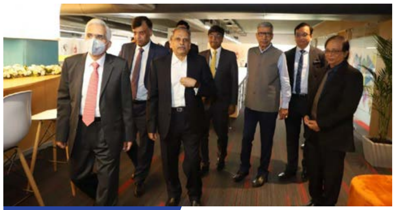
Governor and Deputy Governor with RBIH's Board members